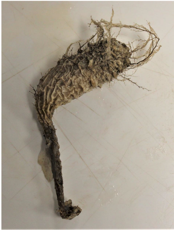
Fig. 2 Image of the single Styela clava specimen collected in Scapa Flow, Orkney on 18 December 2020 (approximately 100 mm length)

Carron. This represents a poleward shift of the known distribution limit of S. clava of 168 km (Fig. 3). Subsequent diver-based surveys of suitable substrates for recruitment of this species in the immediate area did not find any additional examples. The possibility of establishment of S. clava in Orkney and the potential ecological impacts of its presence are of great concern from a local biodiversity perspective and may impact aquaculture installations (Davis and Davis 2008; Darbyson et al. 2009).