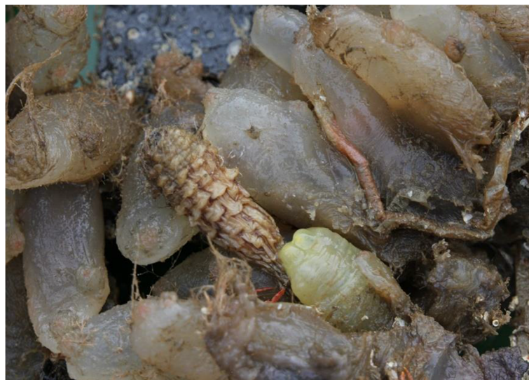
Fig. 1 Detail of fouling organisms retrieved from Scapa Flow on 18 December 2020. Fouling was dominated by the solitary tunicate Ascidiella aspersa but included a single individual of the leathery sea squirt Styela clava . This image also features an individual Ciona intestinalis sea squirt

The invasive non-indigenous leathery sea squirt S. clava has been rapidly expanding its range in UK waters since being first recorded in the early 1950s. This new report from Scapa Flow in Orkney of a single adult specimen constitutes a 1.54° latitudinal extension from the previously recognised most northerly record, from Loch